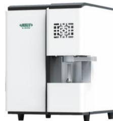
Carbon And Sulfur Analyzers