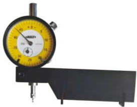
Buttress Thread Run-Out Gauges