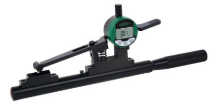
Digital Thread Height Measuring Instruments