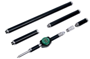
Carbon Fiber Bore Gauges