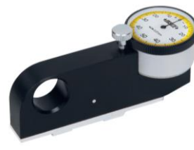
Buttress Thread Tooth Thickness Gauges