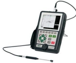
Eddy Current Flaw Detectors