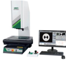
CNC Vision Measuring Systems