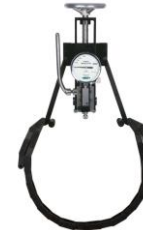
Chain Type Hydraulic Brinell Hardness Testers