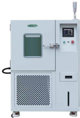
Temperature And Humidity Chambers