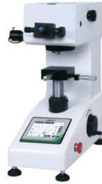
Vickers Hardness Testers