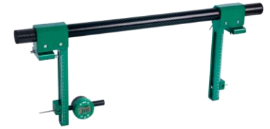
Carbon Fiber Comparison Gauges