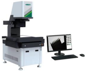
Quick Measurement Systems