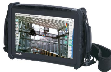
Industrial Acoustic Imagers