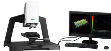
White Light Interference Measuring Microscopes