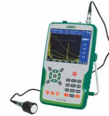
Ultrasonic Flaw Detectors