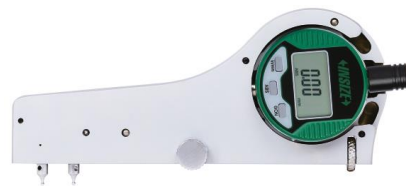
Digital Thread Pitch Measuring Instruments