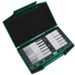
Surface Roughness Specimen Sets