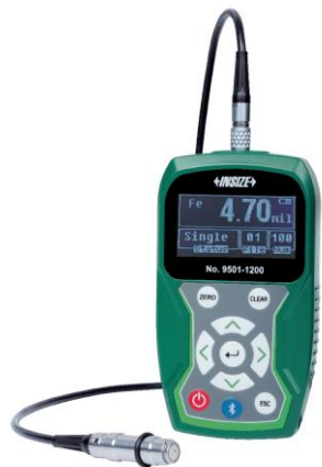
Coating Thickness Gauges