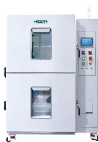
Thermal Shock Test Chambers