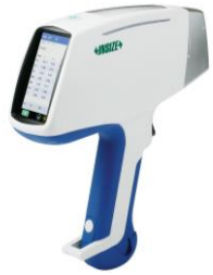
Handheld XRF Alloy Analyzers