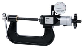
Portable Brinell and Rockwell Hardness Testers