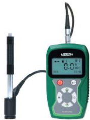
Leeb Hardness Testers