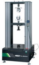
Electronic Universal Testing Machines