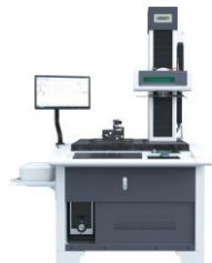
Roughness Measuring Machines