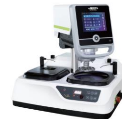
Automatic Grinders And Polishers