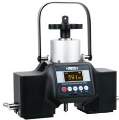
Digital Magnetic Rockwell Hardness Testers