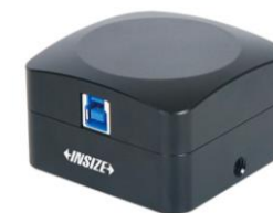
Metallurgical Analysis Software And Cameras