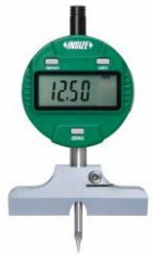
Digital Depth Gauges