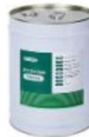
Fluorescent Penetrant Fluids