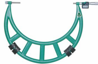
Digital Outside Micrometers