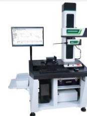
Surface Profile Measuring Machines