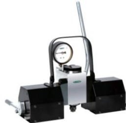
Magnetic Brinell Hardness Testers