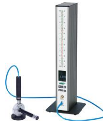
Air Gauges And Displays