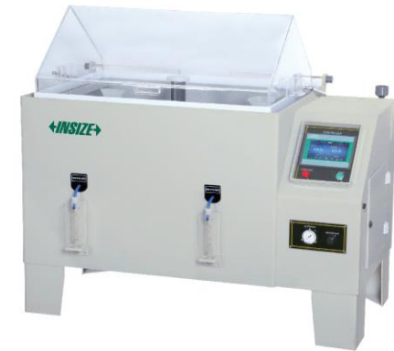
Salt Spray Test Chambers