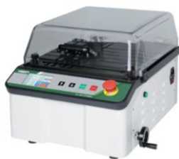
Automatic Precision Cutting Machines