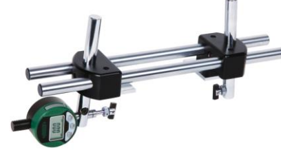
Digital Groove Diameter Measuring Instruments