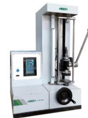
Manual Spring Testing Machines