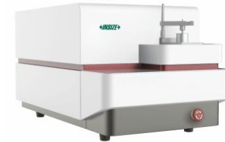
Spark Direct Reading Spectrometers