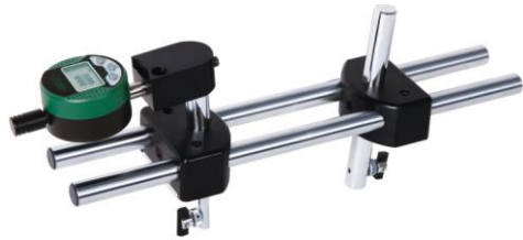
Digital Thread Crest Diameter Measuring Instruments