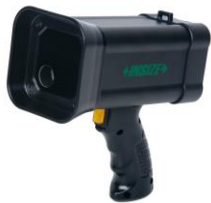
UV/White Light Flaw Detection Lights