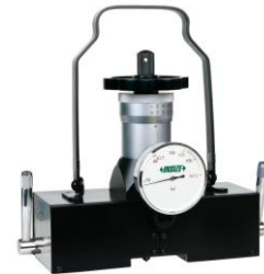
Magnetic Brinell and Rockwell Hardness Testers