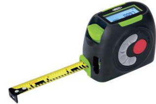
Wireless Digital Measuring Tapes + Laser Distance Meters