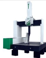
Coordinate Measuring Machines