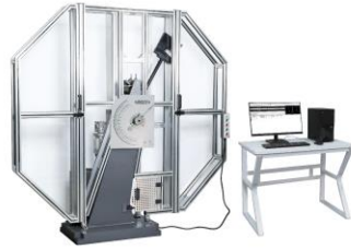
Impact Testing Machines