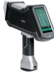
Handheld Libs Spectrometers