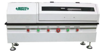
Electronic Torsion Testing Machines