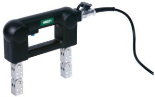
Magnetic Powder Flaw Detectors