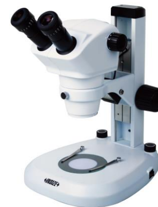
Zoom Stereo Microscopes