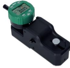
Digital Groove Width Measuring Instruments