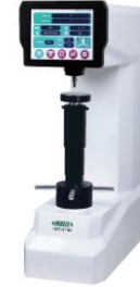
Rockwell Hardness Testers