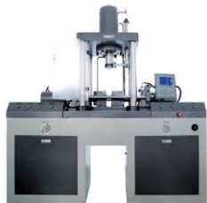
Vertical Bending Testing Machines