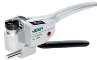
Aluminum Hardness Testers