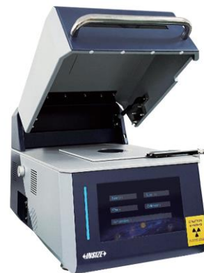
XRF Plating Thickness Instruments