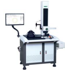
Roundness Measuring Machines